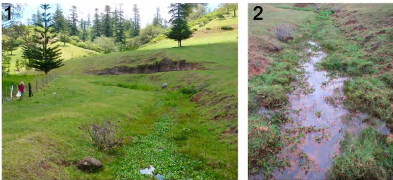
Figs 1-2. Cockpit Falls Reserve was one of the collecting sites where, over the years 2012-2015, cattle roamed freely: (1) the stream was choked along some reaches by water hyacinth ( Eichhornia crassipes ); (2) elsewhere damaged severely by cattle; and just a little further upstream of these sections was choked by a thicket of taro ( Colocasia esculenta ) and bullrushes ( Typha sp.).